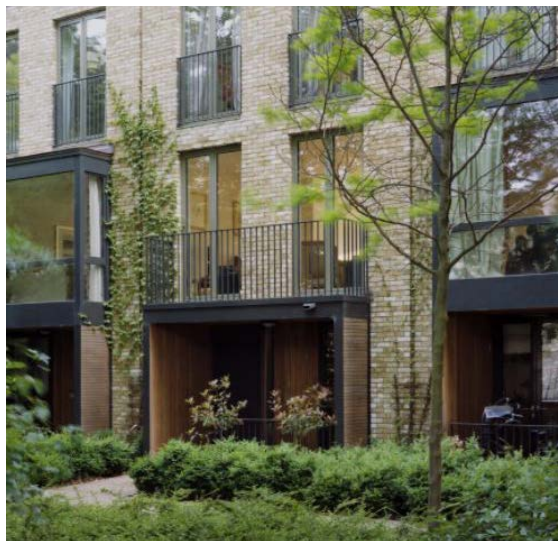
Planning for the next generation of trees in Accordia, Cambridge