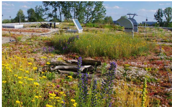
Biodiverse roof with sedum, wildflowers and hibernaculum