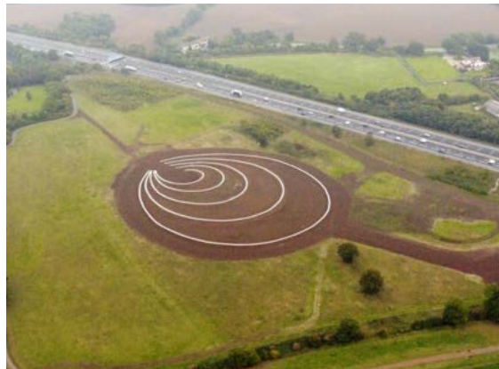
Theydon Bois Earthwork