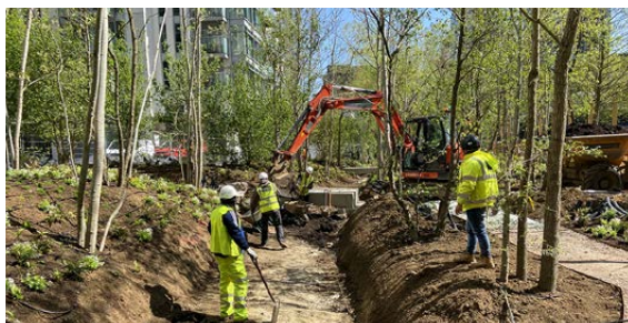
New tree planting in urban 'Forest' by Spacehub

£86-390 (depending on specification of tree and planting density)