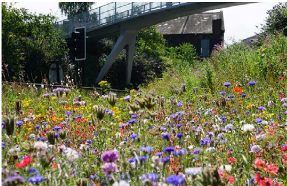
Roadside wildflowers in Sheffield

£2-7 (depending on seeding or turfing options)