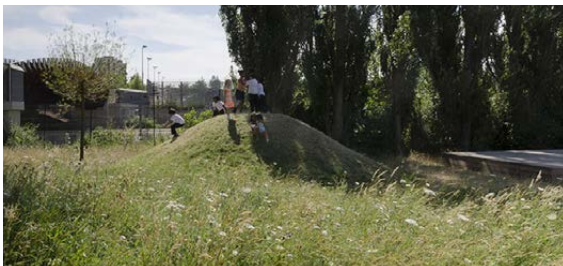
Drapers Field, Waltham Forest by Kinnear Landscape Architects