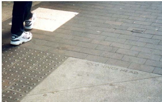
Borough Highstreet by East Architecture