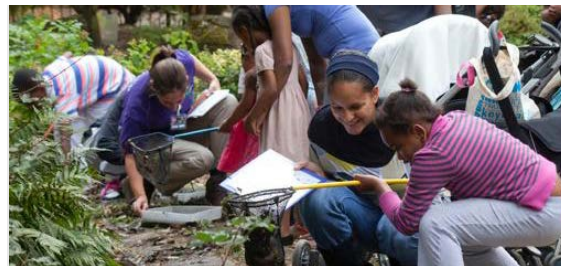
Warpole Park, Ealing by J&L Gibbons