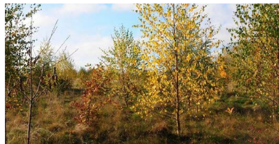
New woodland creation at Heartwood Forest, Hertfordshire