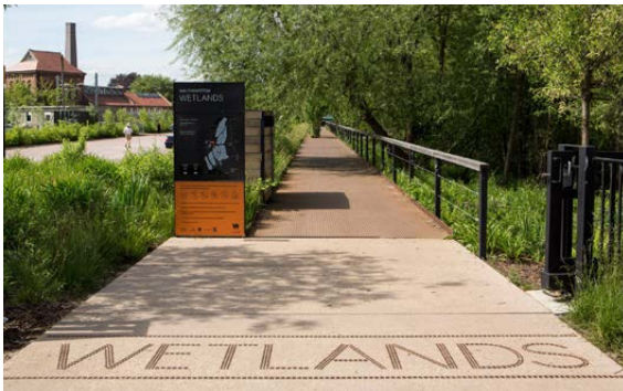
Walthamstow Wetlands by Kinnear Landscape Architects