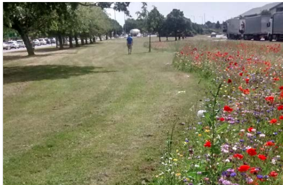
Roadside meadow planting in Leeds