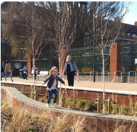
Street SuDS in White City, by Robert Bray Associates

Further guidance on projects for small sites and individual homes has been produced by Rewild My Street .