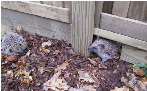
Wildlife-friendly garden fencing