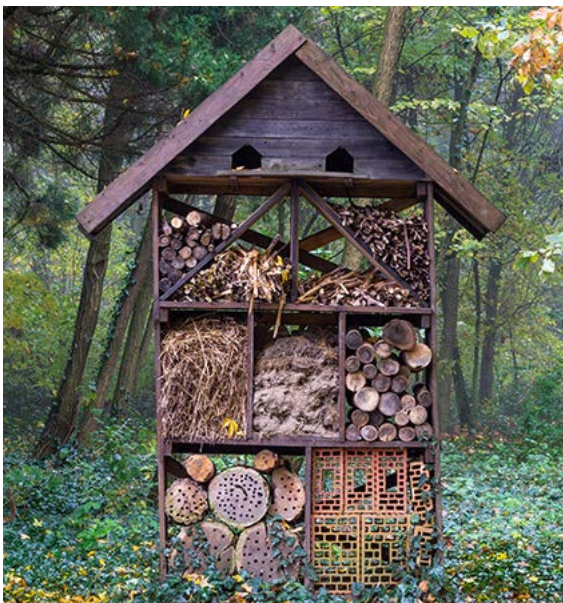
An example of a bug hotel

Typical cost: £9-35 per sqm (depending on planting type and planting density)